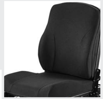
Optimal sitting comfort – optimal adaptability