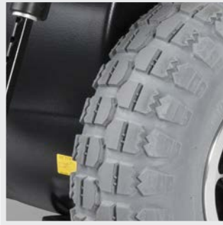
Excellent traction and off-road capability